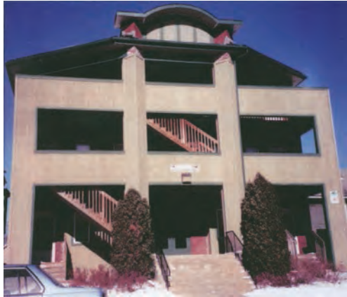
Transitional Living Apartments

The MELD Transitional Living case coordinators assist the young parents in assessing their needs and in developing their goals; specifically in the areas of parenting, money management and education/vocational pursuits. Once goals are set, staffings with all appropriate community agencies are held where the role and responsibility of each individual and agency is agreed upon. As these young families strive to be independent they are also given the support they need as they deal with the tribulations of the real world and the barriers that they encounter.