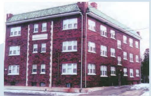
MELD Trinity House Homeless Shelter

*The shelter is licensed for 16 young moms and children. However, as of July 2009, due to funding cuts, we can ONLY house 8 homeless young mothers and their children at our homeless shelter.